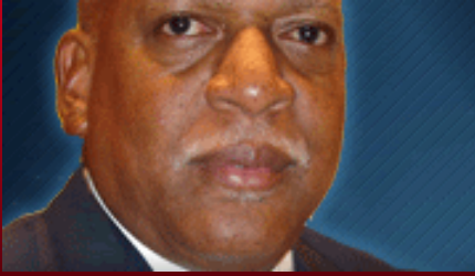
Rodger Smitherman STATE SENATE DISTRICT 18